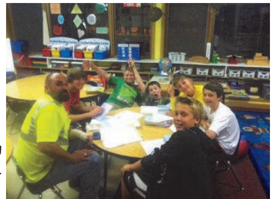
One of our many Pathway groups having small group.